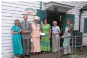
Before setting off for the palace

"My husband and I ..." were astonished to receive a letter in February from the Lord Lieutenant of Kent asking whether our names could go into the ballot for an invitation to tea at Buckingham Palace, a 1 in 3 chance that we gladly